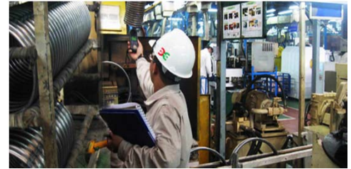
Goshi-Thanglong Co., Ltd