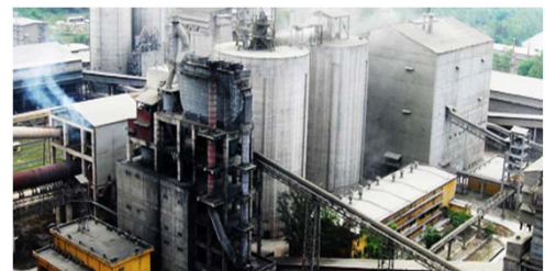
Bim Son cement JSC