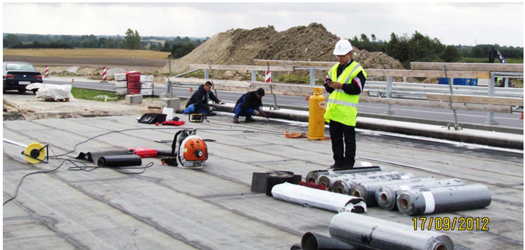
Vipperødvej Bridge (NIRAS 's Elverdam-Regstrup Project)